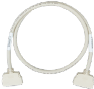
50P / 68P / 100P