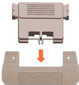
Step3 : The diode holder is assembled back to the component plug.