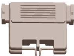
Step2 : The two terminals of the diode are bended towards the center of the holder.