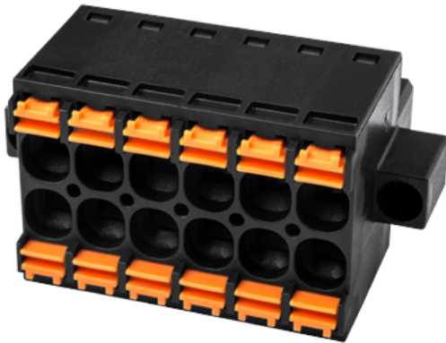
Twin connectors design, the pole number is half of the total connection points. photo shows a 12 connection product, the pole number is 06.