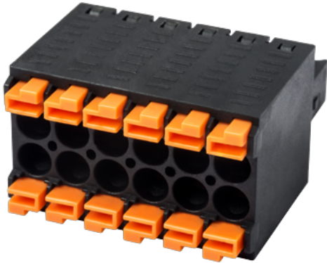
Twin connectors design, the pole number is half of the total connection points. photo shows a 12 connection product, the pole number is 06.