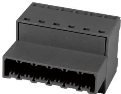
Twin connectors design, the pole number is half of the total connection points. The photo shows a 12 connection product, the pole number is 06.