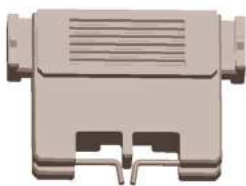
Step2 : The two terminals of the diode are bent towards the center of the holder.