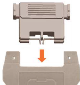
Step3 : The diode holder is assembled back to the component plug.