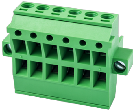
Twin connectors design, the pole number is half of the total connection points. photo shows a 12 connection product, the pole number is 06.