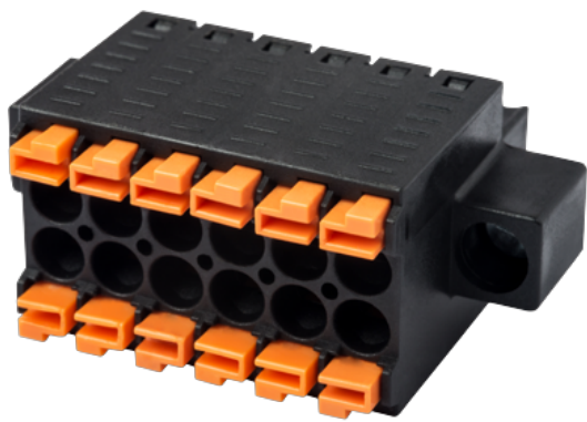
Twin connectors design, the pole number is half of the total connection points. photo shows a 12 connection product, the pole number is 06.