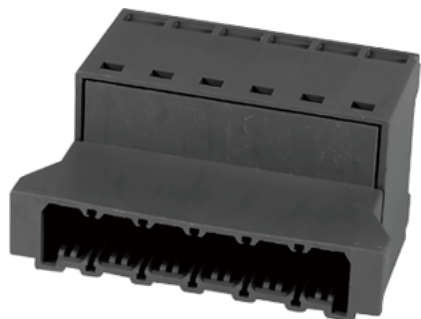
Twin connectors design, the pole number is half of the total connection points. The photo shows a 12 connection product, the pole number is 06.